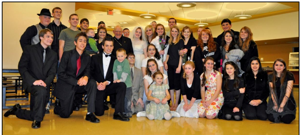
Cast and crew with Bishop Loverde following the Saturday evening performance, of The Jeweler's Shop